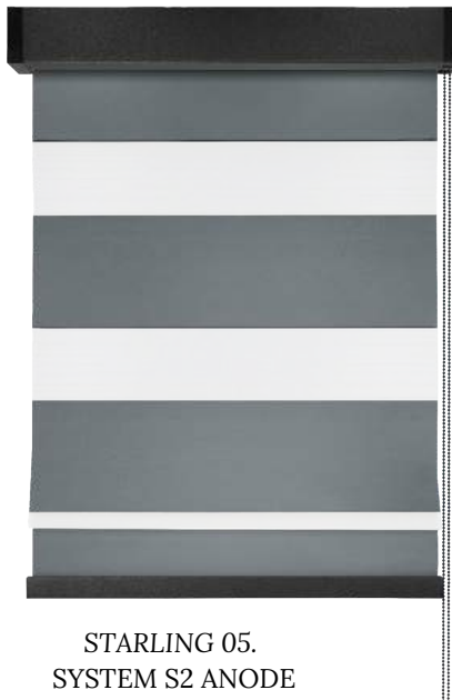
STARLING 05. SYSTEM S2 ANODE