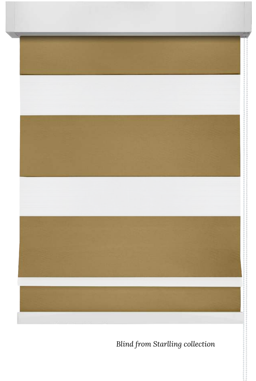
Blind from Starling collection

Roman roller blind Day and Night without doubt can be an alternative to curtain or shade. Application of two types of materials in Roman roller blind in one plane makes the roller blind extremely elegant. If you decide to choose the Roman roller blind you get style and functionality. Even the most demanding user will find it enjoyable!