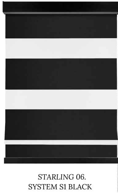
STARLING 06. SYSTEM S1 BLACK