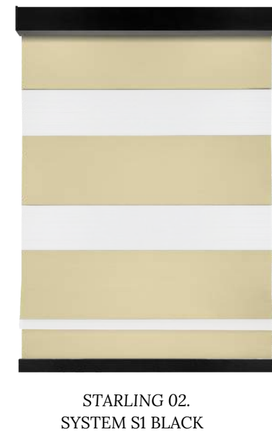
STARLING 02. SYSTEM S1 BLACK