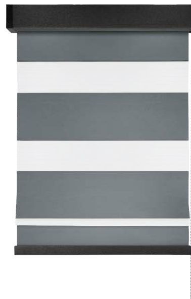
blind from the Starling collection S2 anode