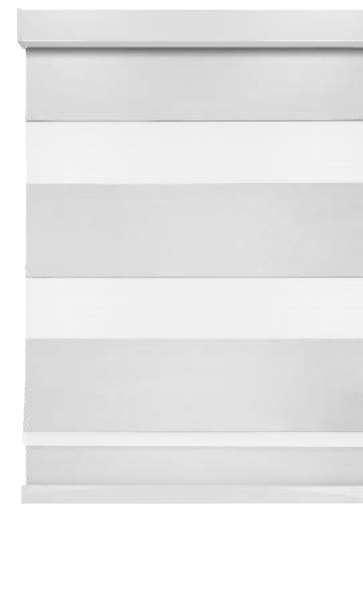
blind from the Starling collection S1 white