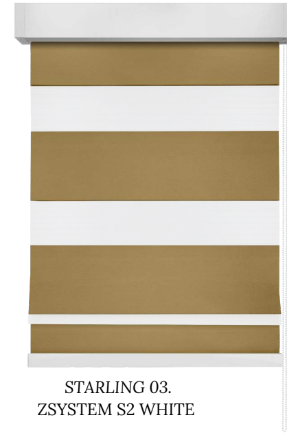
STARLING 03. ZSYSTEM S2 WHITE