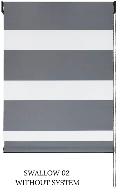
SWALLOW 02. WITHOUT SYSTEM